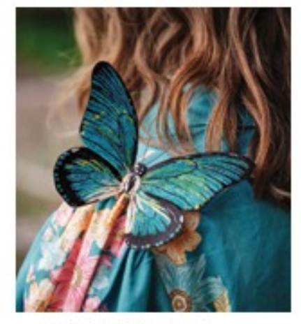
INS122-P2 Papilio Zalmoxis