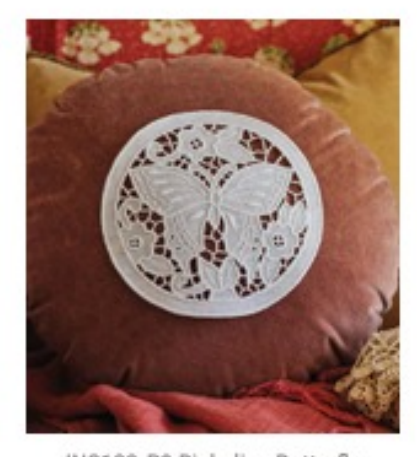
INS122-P8 Richelieu Butterfly