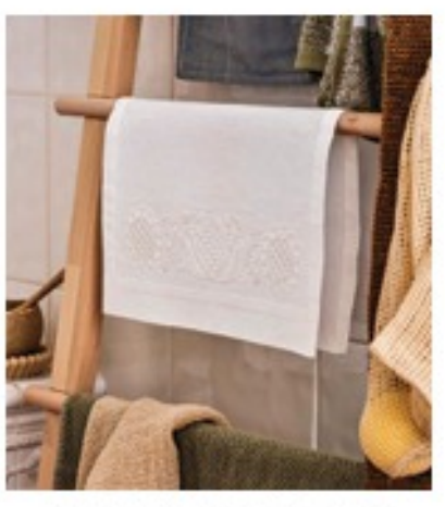
INS122-P3 Tulip & Sunflowers