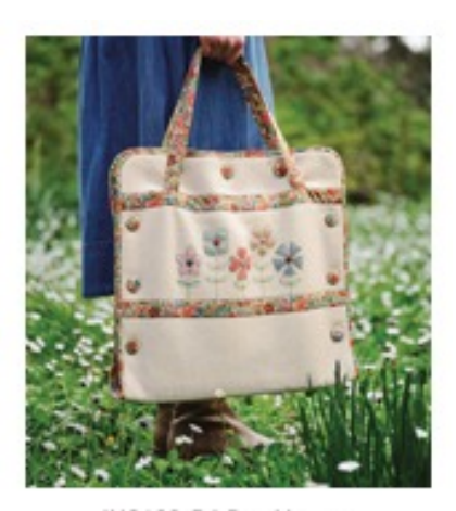
INS122-P6 Bon Voyage