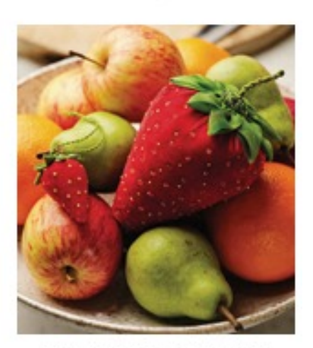
INS122-P4 Strawberry Delight