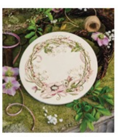
INS122-P7 Ribbons & Roses