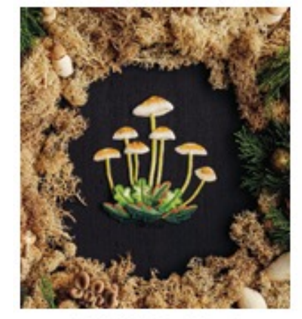
INS122-P1 Forest Fungi