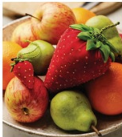
INS122-P4 Strawberry Delight