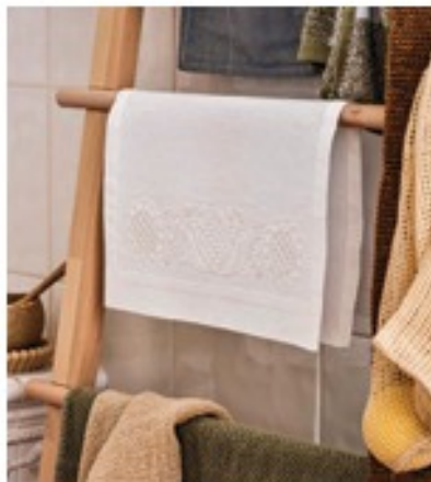
INS122-P3 Tulip & Sunflowers