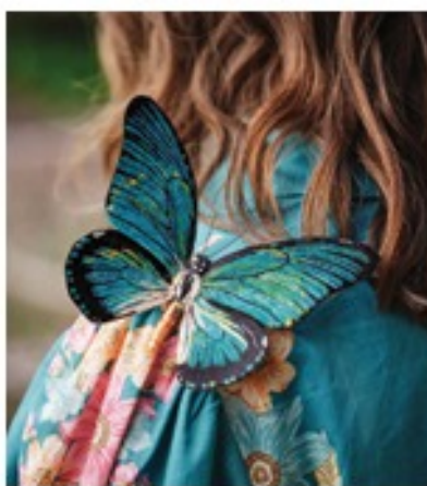
INS122-P2 Papilio Zalmoxis