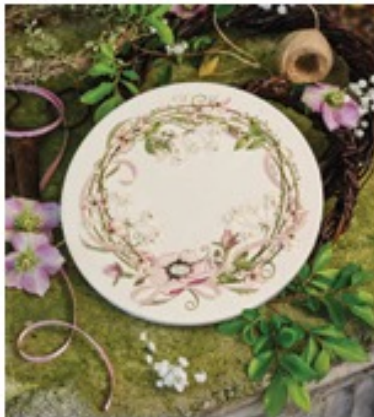
INS122-P7 Ribbons & Roses