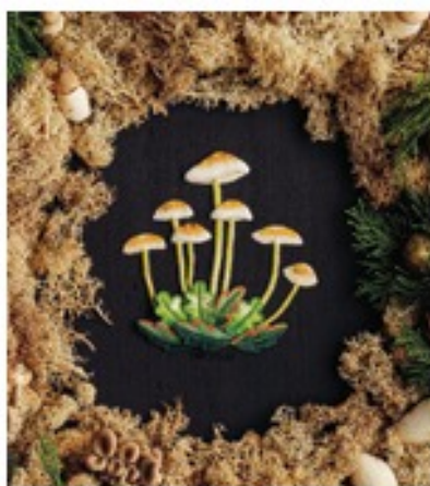
INS122-P1 Forest Fungi