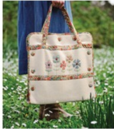
INS122-P6 Bon Voyage