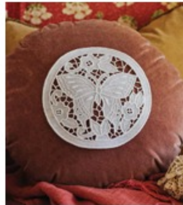
INS122-P8 Richelieu Butterfly